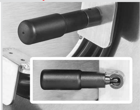
Separated excess patch storage