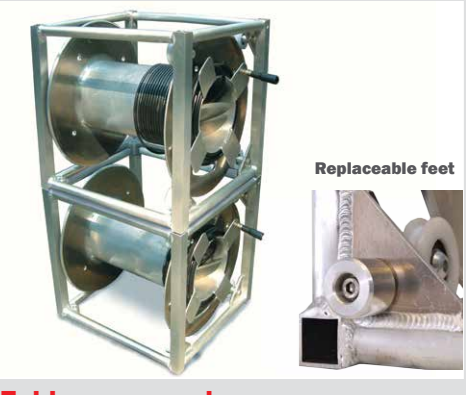
Separated excess patch storage